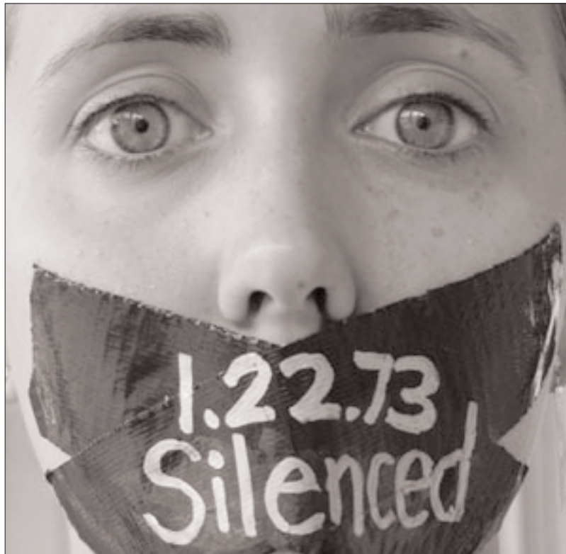
Photo for the Student's Day of Silent Solidarity that will be handed out with information explaining the protest.

Let us know if you need copies of any of our dynamic advertising supplements to hand out to students at your college, high school, or youth group. And if you're in attendance at one of the upcoming events, please feel free to stop by our booth to greet us, we would be thrilled to meet you in person!